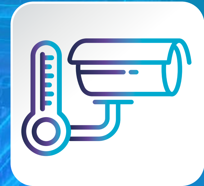
Integrated with CCTV setup