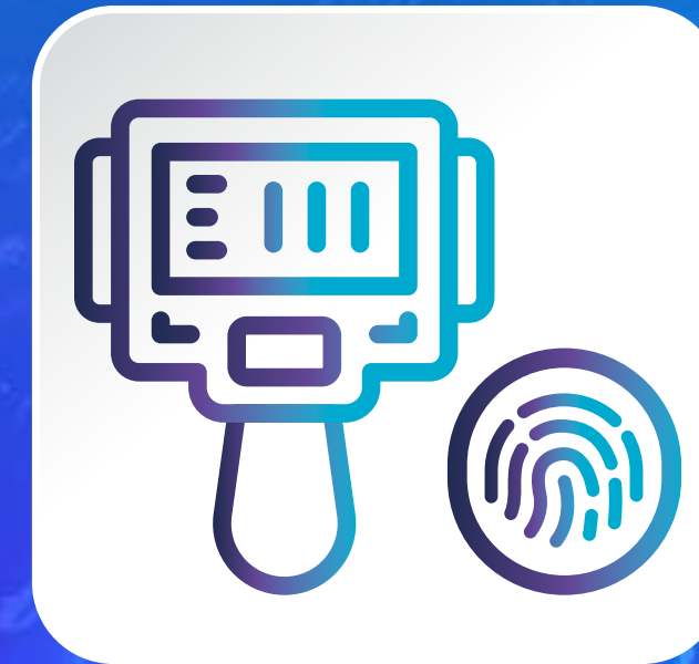
For entrances - with access control