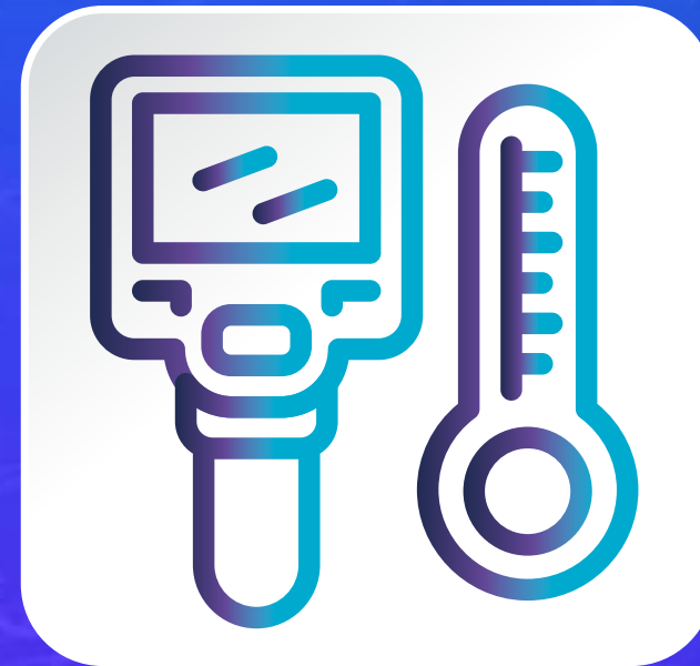
For entrances, stand-alone