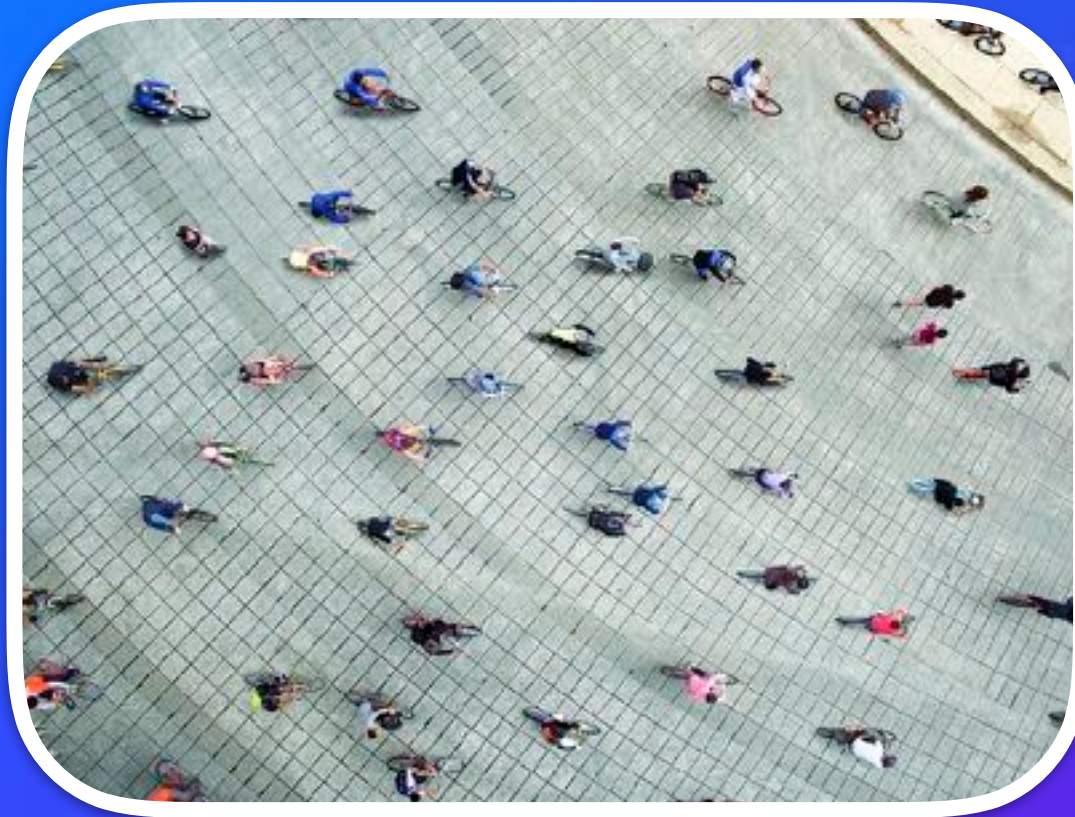
Scan & broadcast.